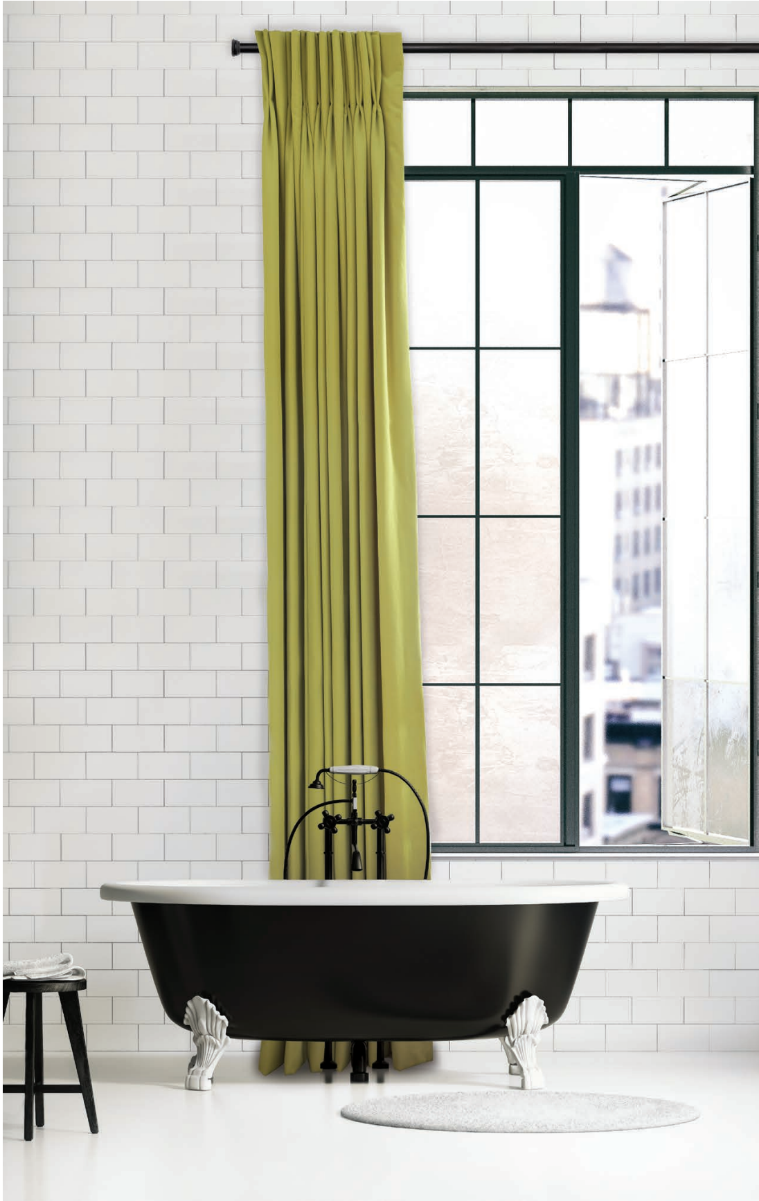
ENDCAP Black Shown