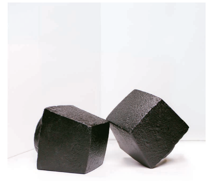
PETITE FAUCET Black shown. Size 1". Available in all colors.