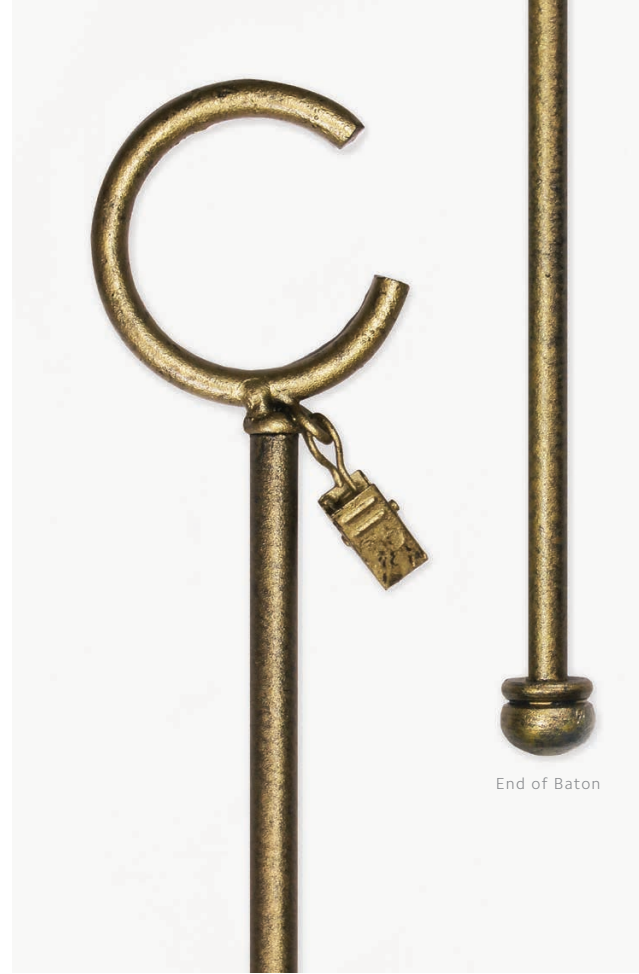
End of Baton

BATON Iron Gold shown. Size 1". Available in all colors.