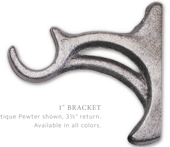
1" BRACKET Antique Pewter shown, 3½" return. Available in all colors.