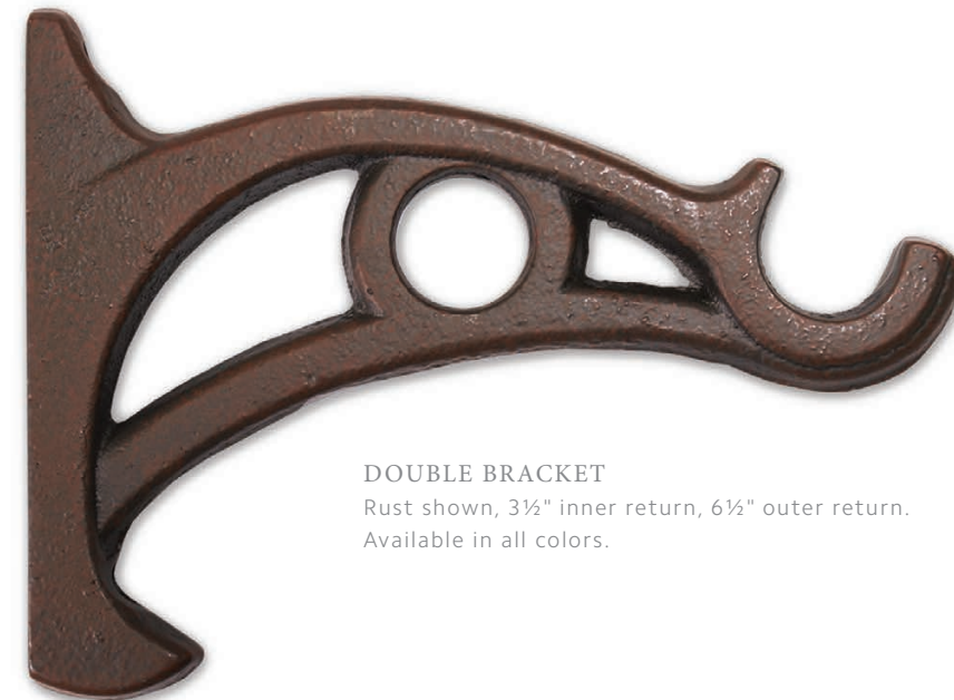
DOUBLE BRACKET Rust shown, 3½" inner return, 6½" outer return. Available in all colors.