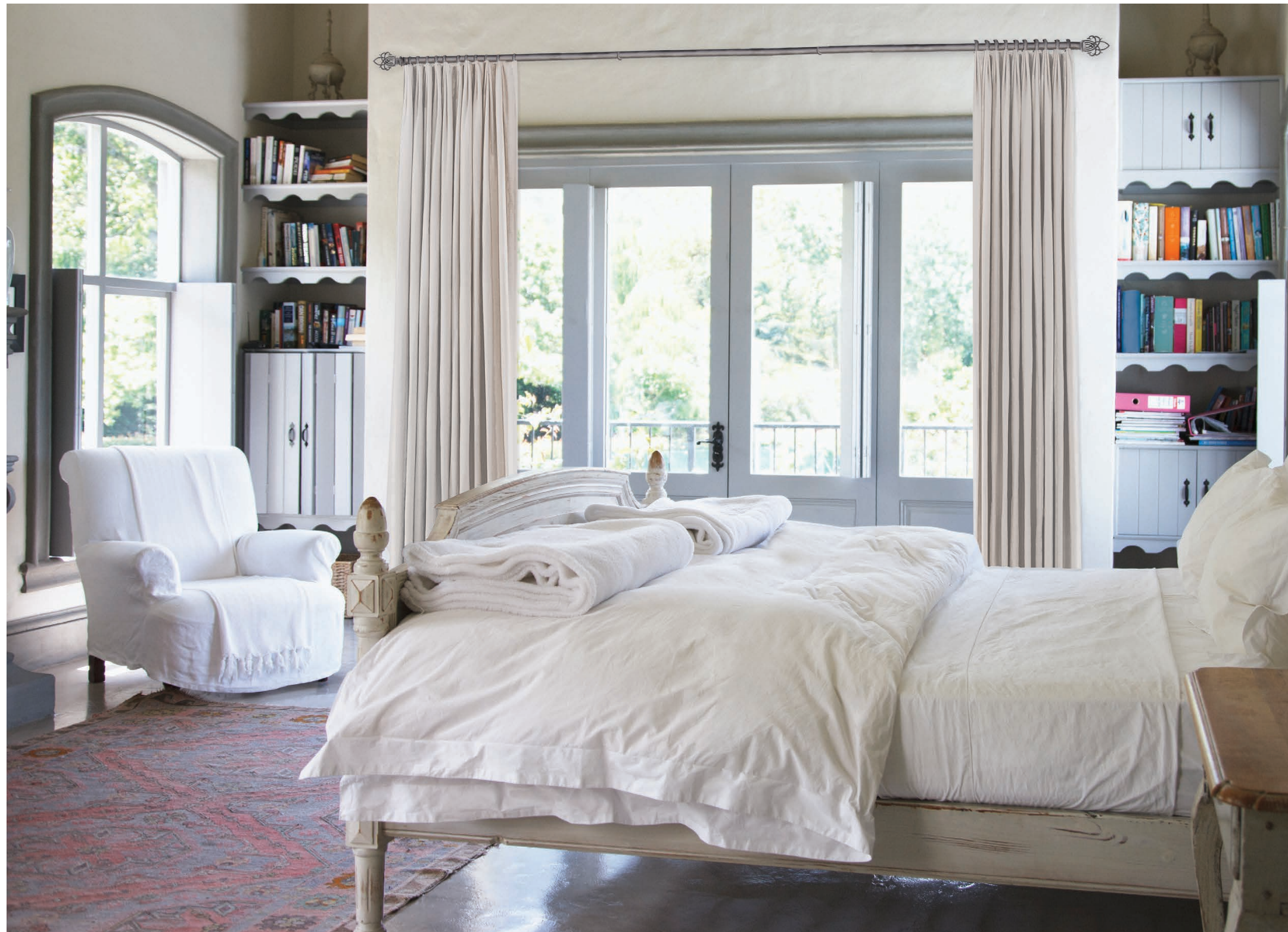
INNER LACE Antique Pewter Shown