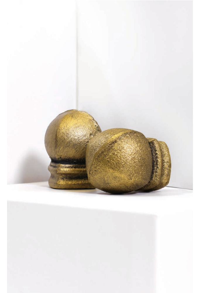
PETITE MODERN BALL Iron Gold shown. Size 1". Available in all colors.