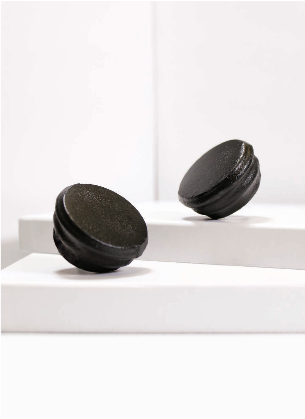
ENDCAP Black shown. Size 1". Available in all colors.