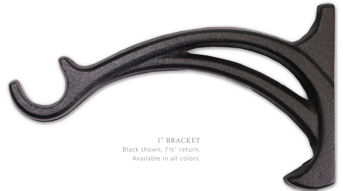
1" BRACKET Black shown, 7½" return. Available in all colors.