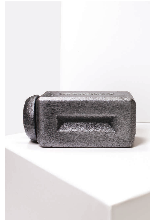
BEVELED BRICK Antique Pewter shown. Size 1". Available in all colors.