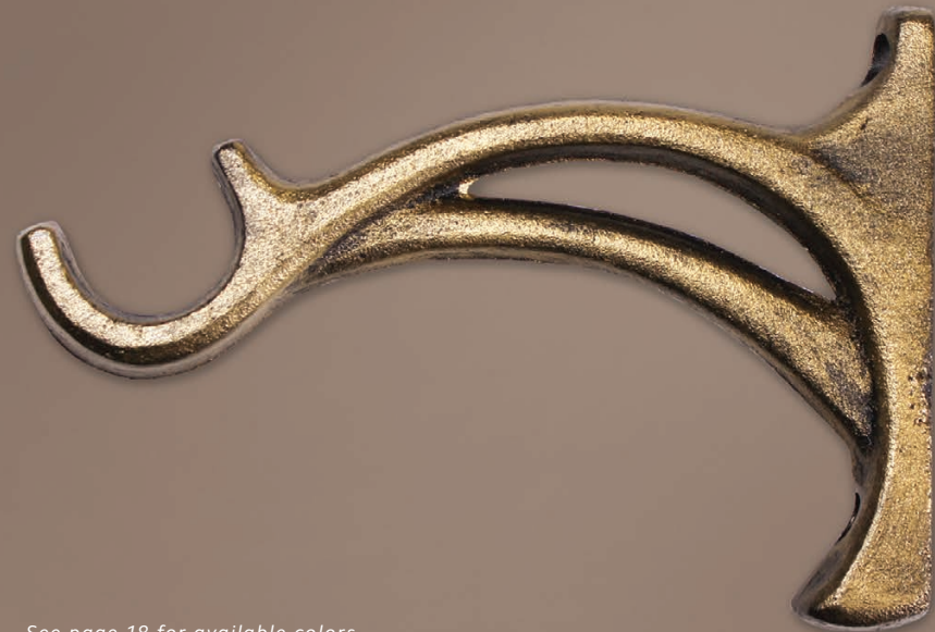
1" BRACKET Iron Gold shown, 5½" return. Available in all colors.