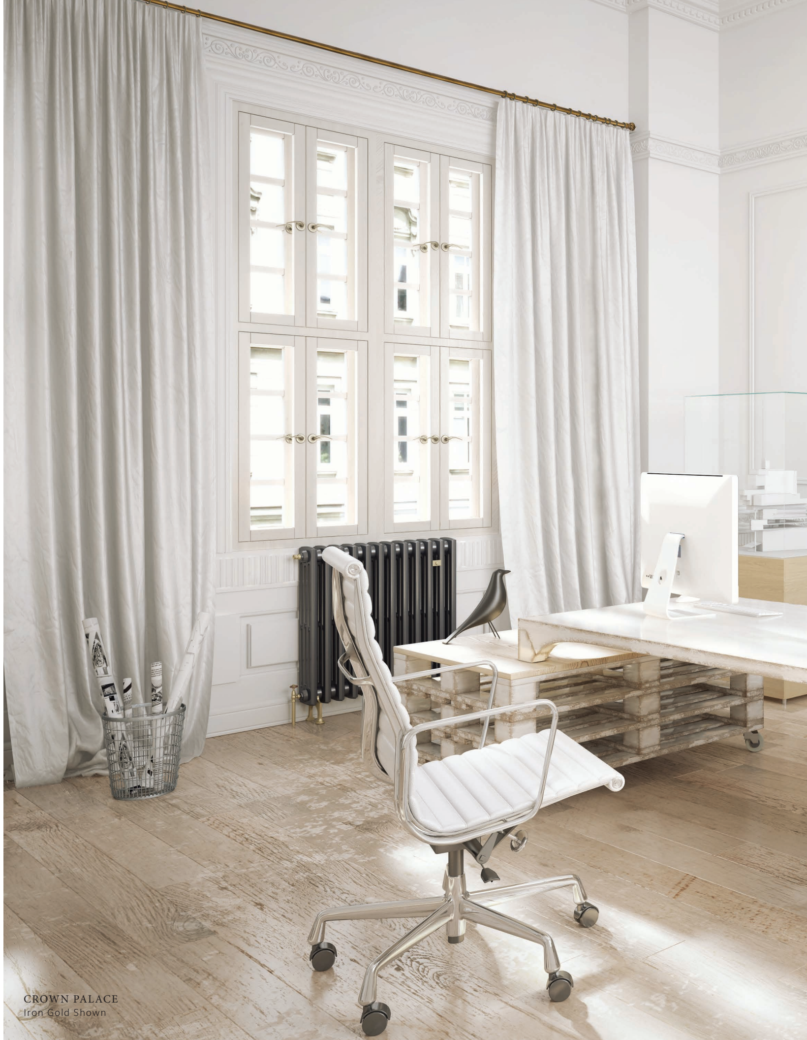
CROWN PALACE Iron Gold Shown