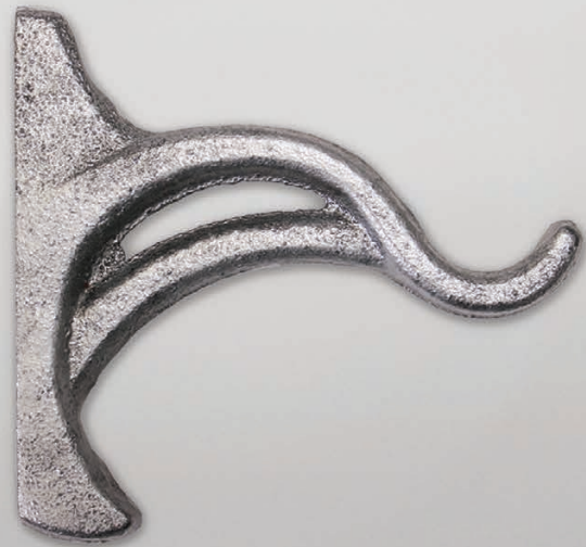
CENTER BYPASS BRACKET Antique Pewter shown, 3½" return. Available in all colors.