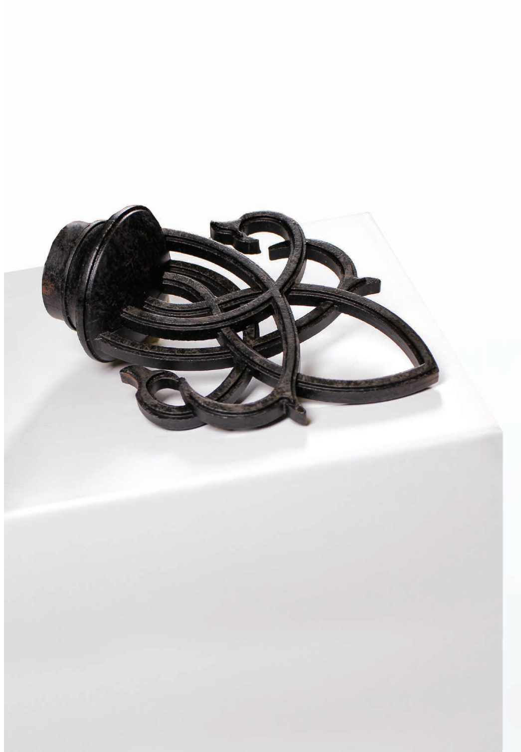
INNER LACE Iron Oxide shown. Size 1". Available in all colors.